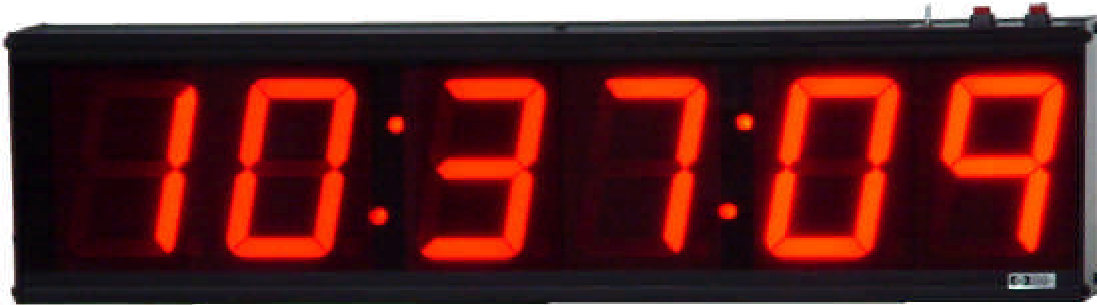
AE46D/CC Super Bright 4-Inch, 6-Digit, Multi-Function Clock/Timer

FOR SCHOOLS, HOSPITALS, FACTORIES, SPORTS FACILITIES, COURTROOMS, THEATERS, BOARDROOMS, CHURCHES, and MUSEUMS.